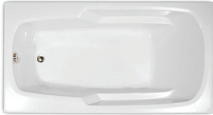
Tub must be set in Mortar Base